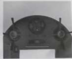
3.The brush on the back of the machine can be installed, removed and cleaned.