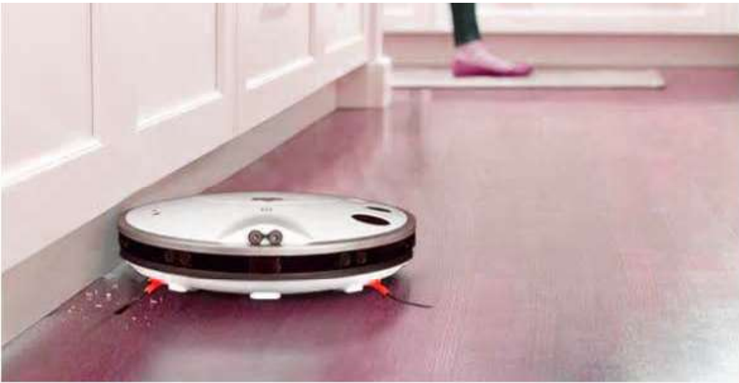
Automation Cleaning Mode