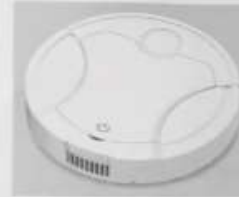
1 This product is a robotic vacuum cleaner dusting and mopping functions.