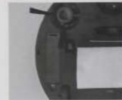
2 Before the first use of the product, remove the insulation sheet on the battery cover and connect the battery correctly (as shown).