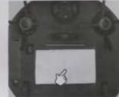
5 The function of mopping the floor: just paste the mopping cloth at the bottom of the product correctly.