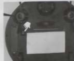
4 Now it can be used normally. Press the power switch and the battery indicator is blue.