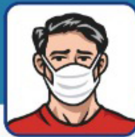
Masked Face Recognition