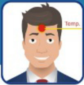
Forehead Temperature Detection