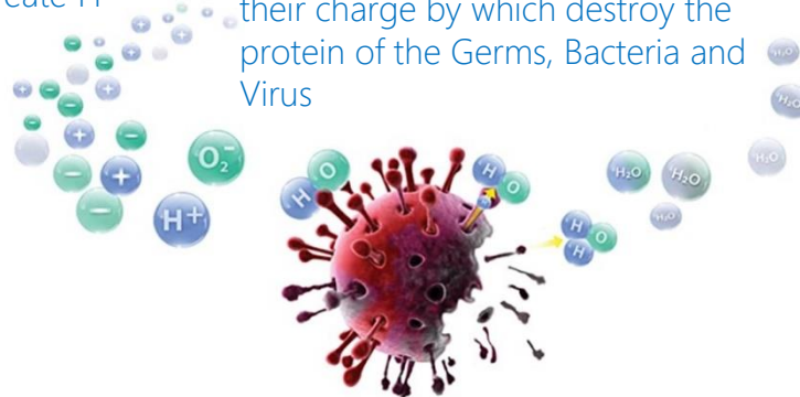
Germs, Bacteria & Virus

3. Plasma Cluster ions Return back to air as Vapor